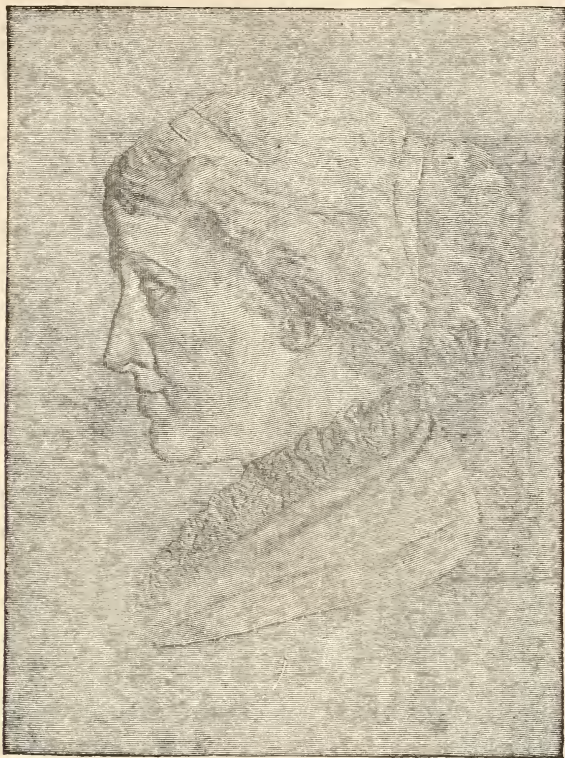
WALTON RICKETSON, SCULP.